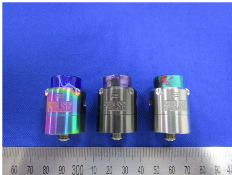
PULSE V2 RDA