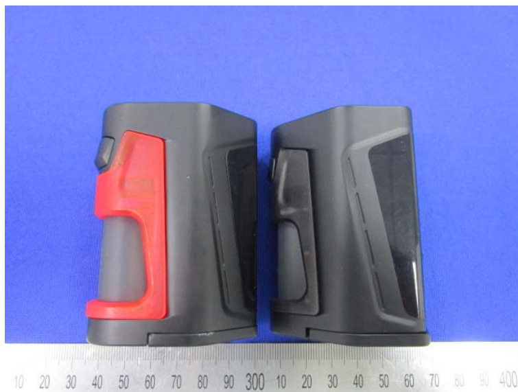
PULSE DUAL 18650 MOD