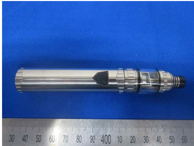
Berserker MTL Starter Kit