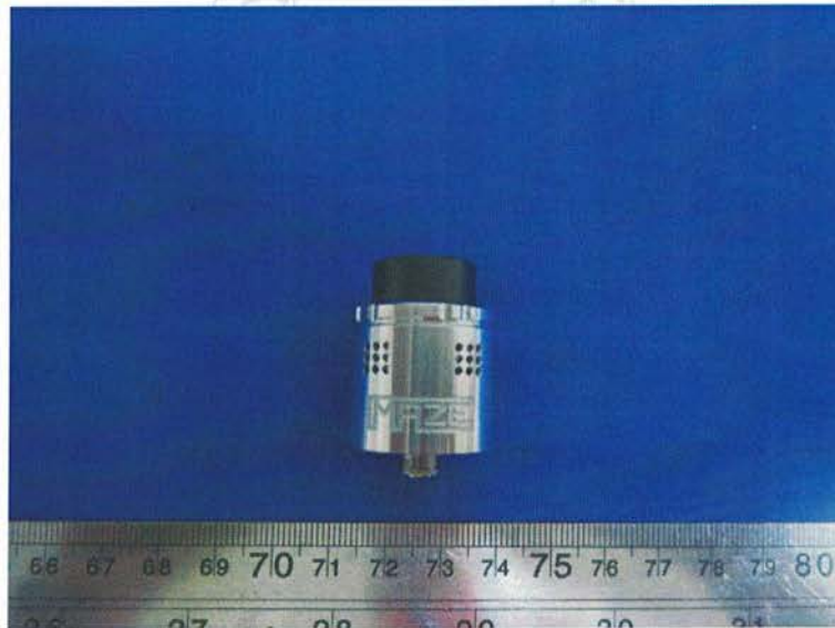
Maze BF Sub RDA