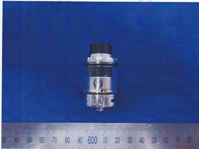
Kylin mini RTA