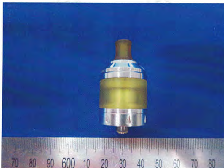
Berserker MTL RTA